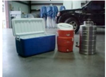
Ice chest, Water jug