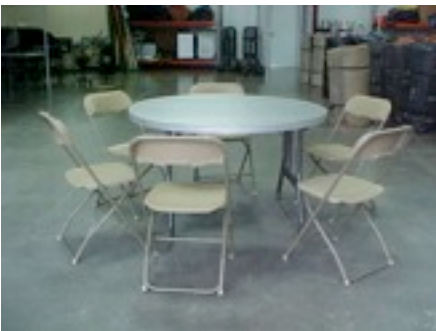
Table & Chairs