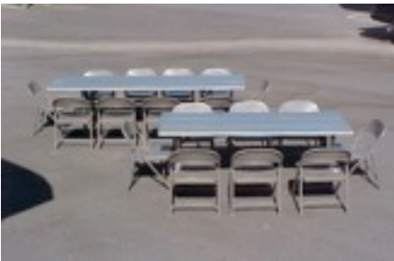
Tables & Chairs